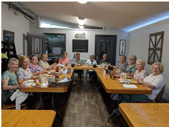
J.U.L.I.E.T. Ladies Breakfast at Grumpy's

Donors are needed for the Westview K-8 Elementary School backpack feeding program. Donation is $30 a month, with a one year commitment. Please come to the Ministry Table to get more information and to sign up.