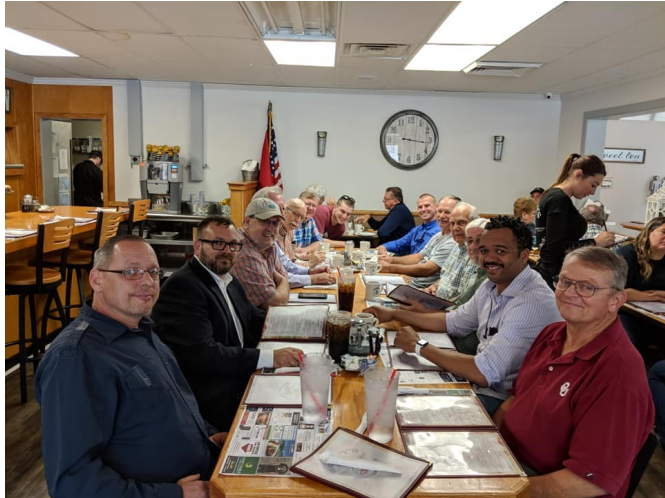
R.O.M.E.O. Men's Breakfast at Grumpy's